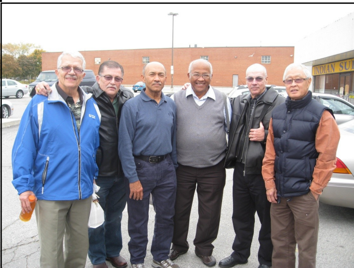
Where shall we meet again in 50 years?

In the previous issue of the newsletter, an alumnus in the photograph on page 3 within the article, Rendezvous at Timehri , was identified incorrectly. The photo with the correct names is shown below. We offer our apologies for this error.