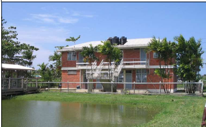
The St. Stanislaus College Farm Complex at Sophia Backlands