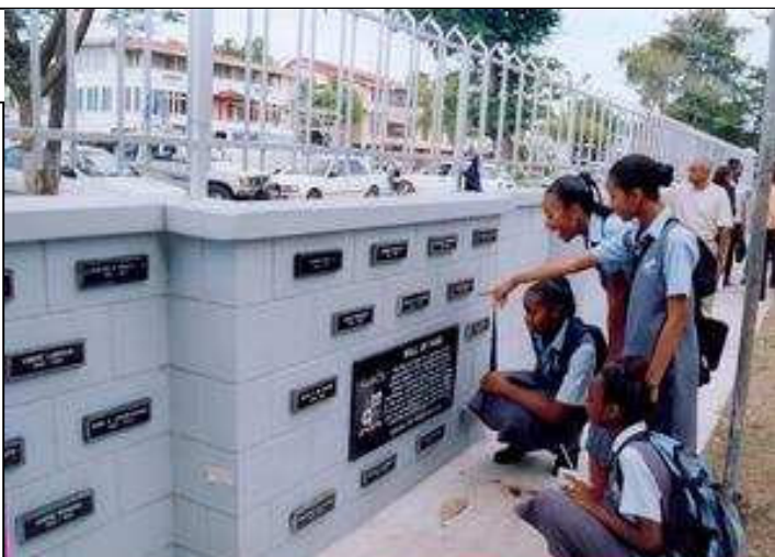
Students of Saint Stanislaus College fascinated by the school's wall of fame opened yesterday.

An additional item of note is the fact that donations of any amount may be made in the name of past members of staff. A plaque will then be installed when sufficient funds have accumulated in the name of the staff member nominated.