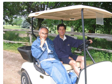
Executive members relaxing?