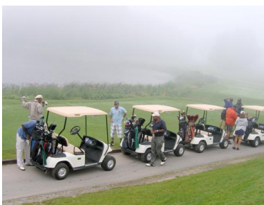
Waiting for the fog to lift