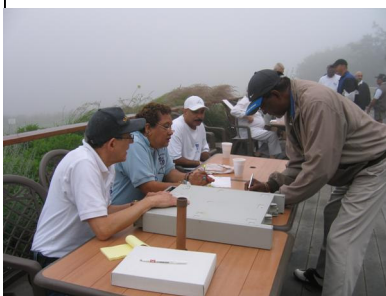
Registering in the fog