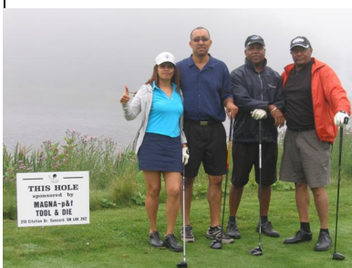
Ladies were welcomed also!