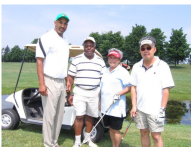
OK! What do we do next?