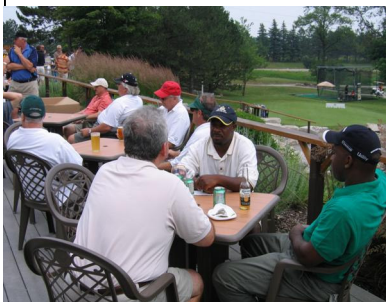
Playing the 19th. hole!