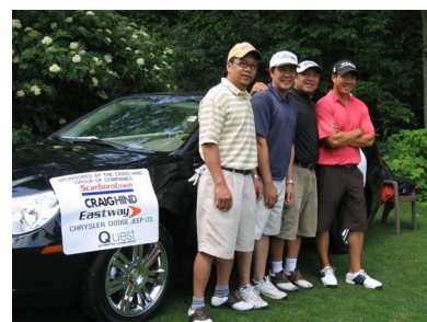
We didn't win the car!