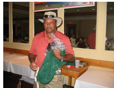
You mean this is all I win?