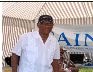
Justice Vibert Lampkin