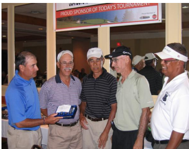
How do we share this prize?