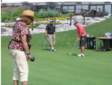
The putting contest