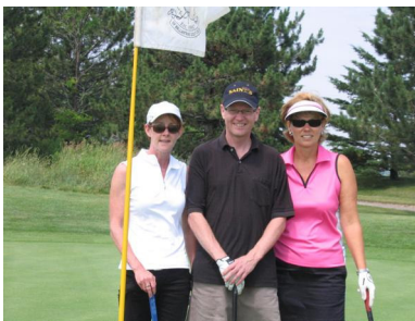
Who's the lucky guy?